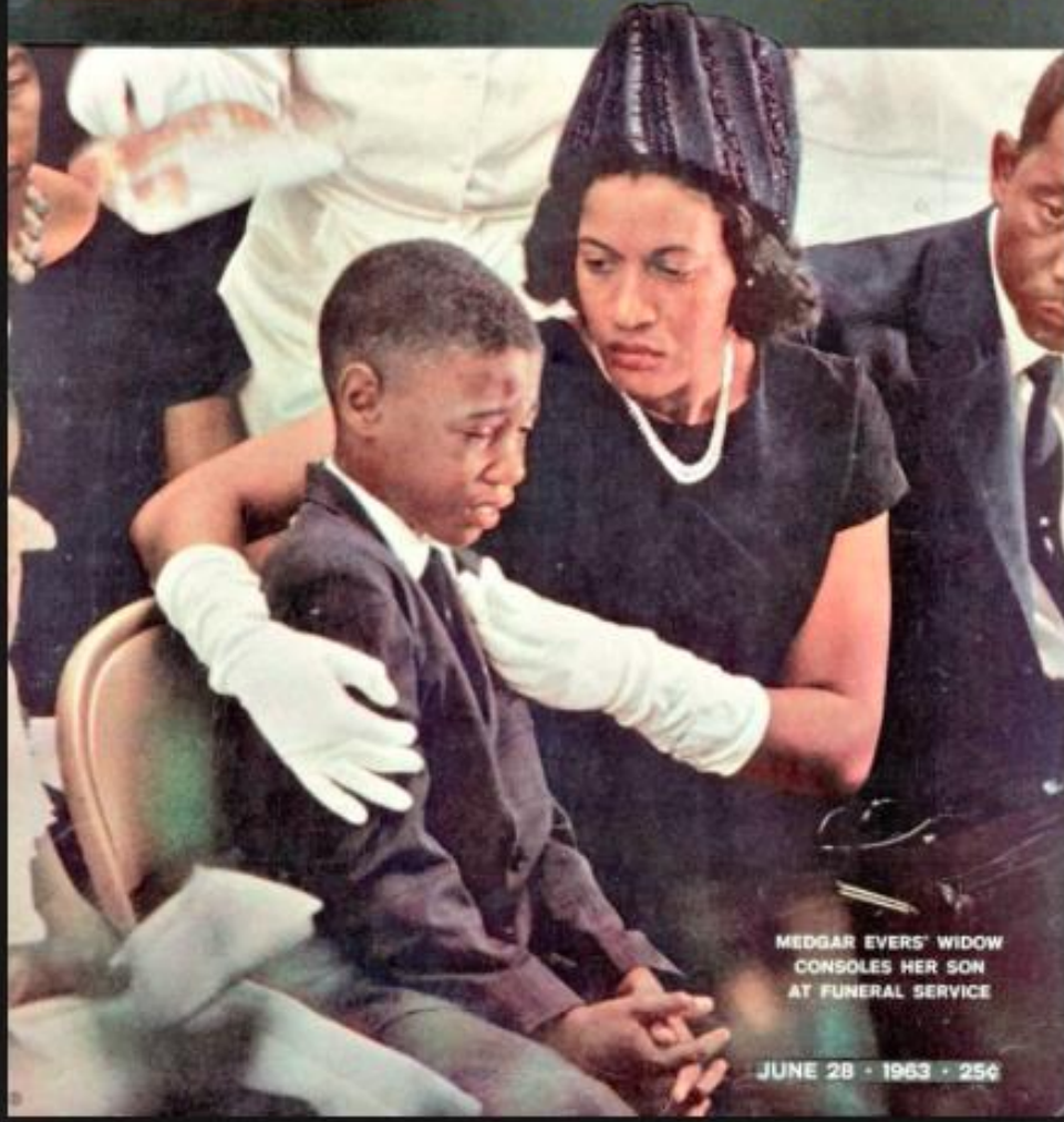
MEDGAR EVERS' WIDOW CONSOLES HER SON AT FUNERAL SERVICE

by CLARE BOOTHE LUCE SOVIET SPACE GIRL MAKES U.S. MEN SOUND STUPID A Martyr—and the Negro Presses On