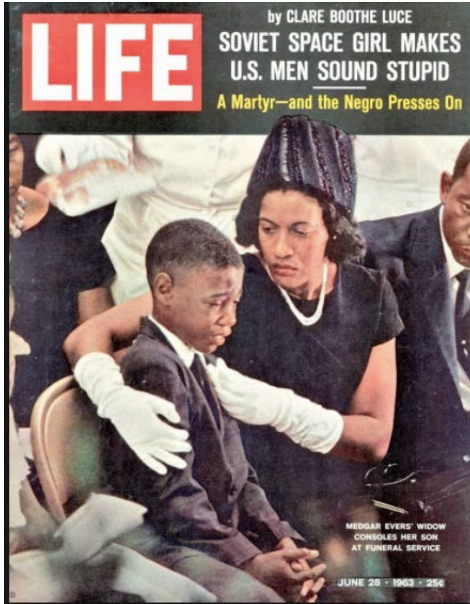
Medgar Evers' funeral procession from Life article.