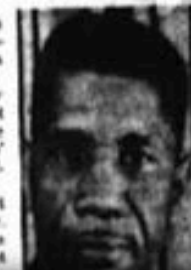
Coverage of Medgar Evers' death in Jackson, Mississippi paper