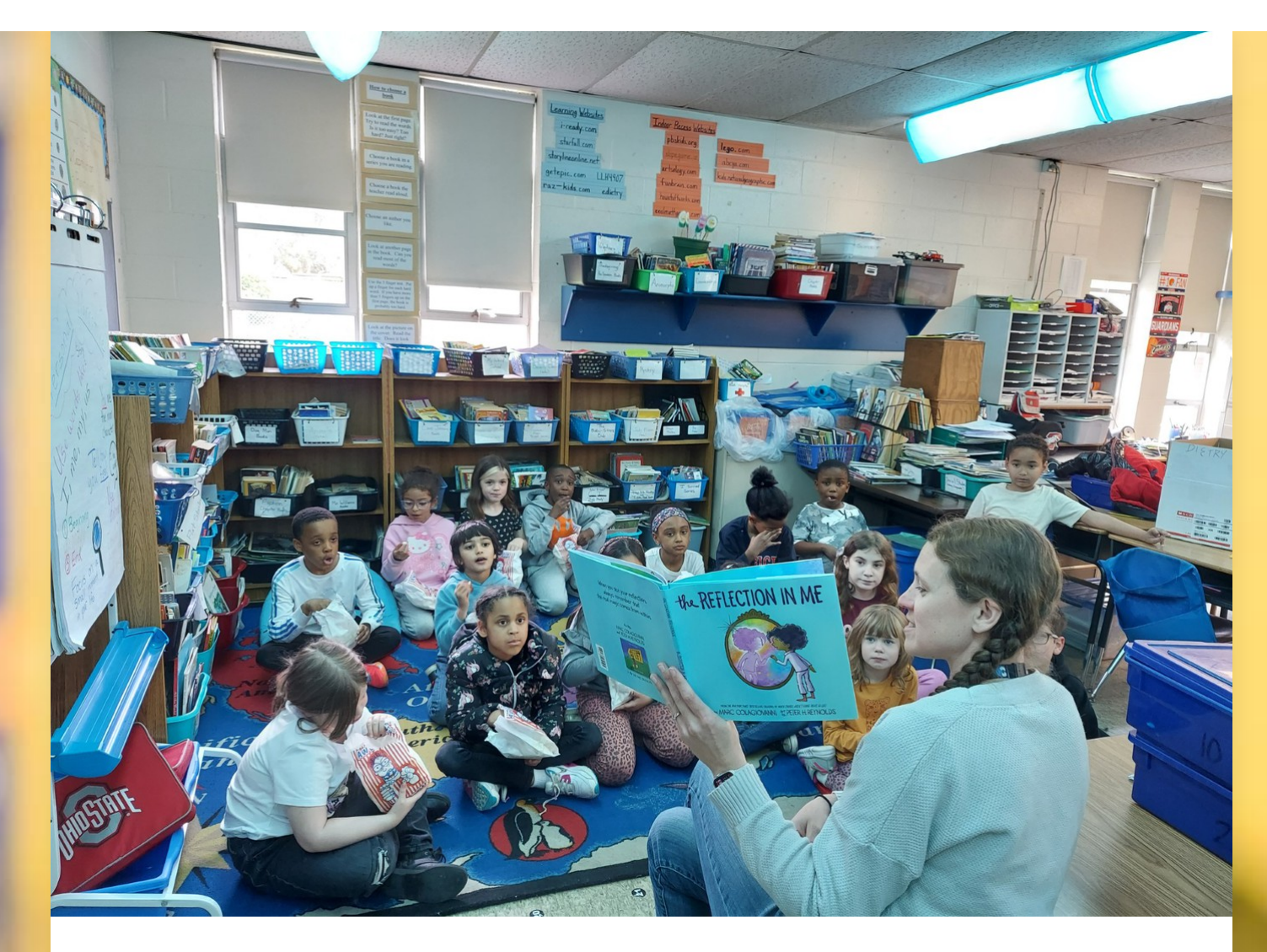
Room 19 -1st GRADE HIGH READERS