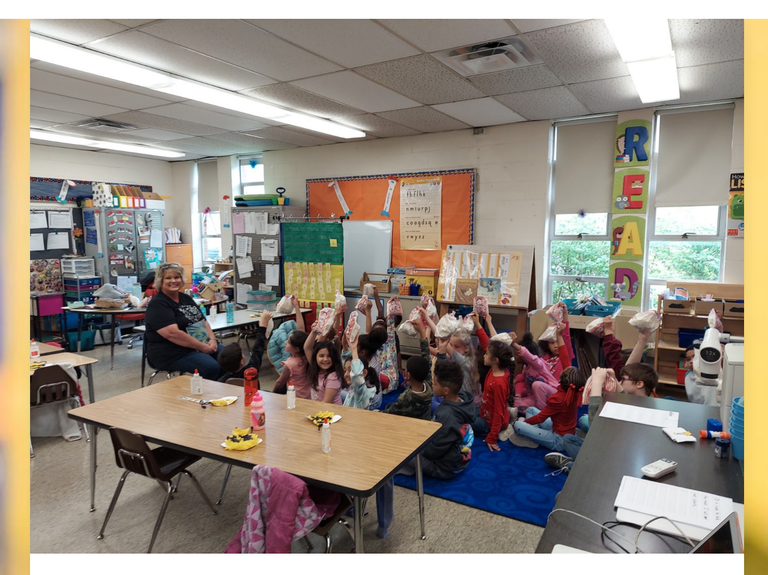
Rm 17 - 2nd GRADE HIGH READERS