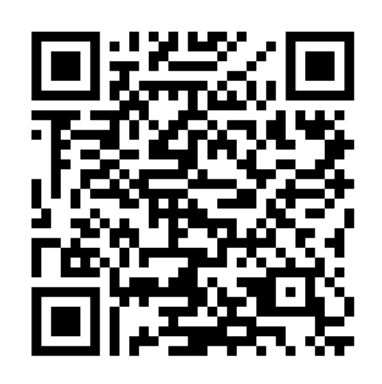
ភាសីខ្ម វ (Khmer) https://surveys.panoramaed.co m/ccsoh/fall23family/surveys? language=km